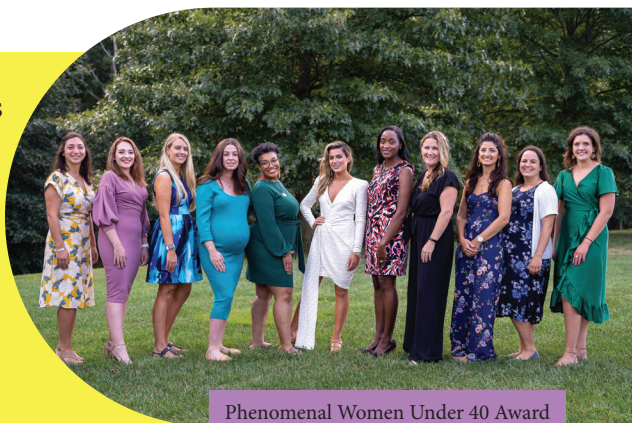
Phenomenal Women Under 40 Award Honorees and Committee