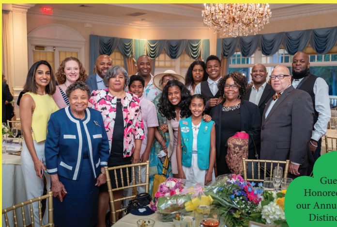
Guests and Honorees enjoying our Annual Women of Distinction Gala