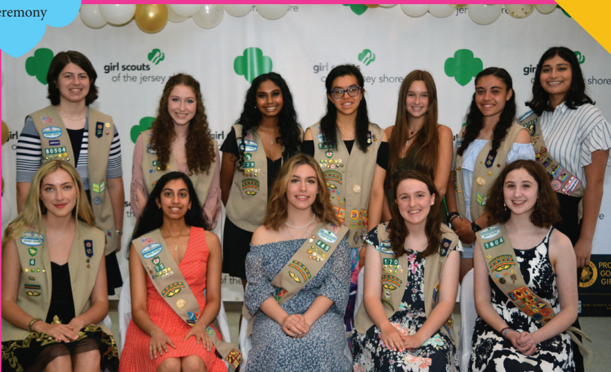
Annual Gold Award Girl Scouts Ceremony