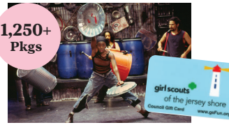
2 Tickets to STOMP at McCarter Theater 6/8/24 OR $100 GSJS Gift card