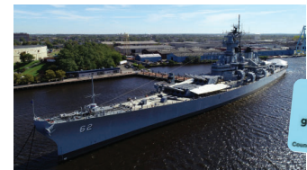
Sweatshirt AND Choice of Battleship NJ 5/18/24 OR $40 GSJS Gift card