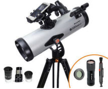
Telescope with ASTRA Astronomy Program TBD OR $200 GSJS Gift card