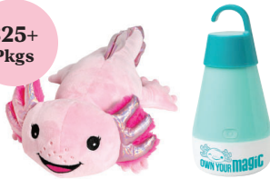
Plush AND Camplight