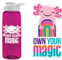
Flair Bottle AND Vinyl Sticker