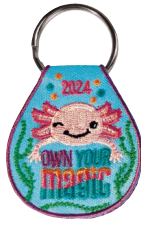
Theme Key Ring