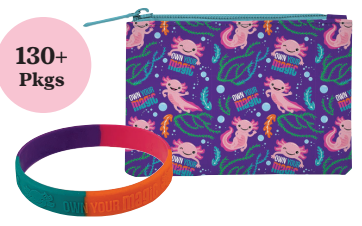
Coin Purse AND Wristband