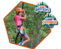
A week of summer fun!