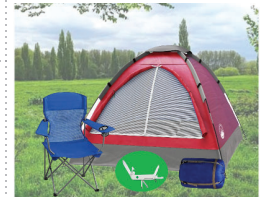
1 Week at GSJS Summer Camp OR Camping Gear and Overnight for Grade 4+ OR Lifetime GSUSA Membership for Graduating Ambassadors