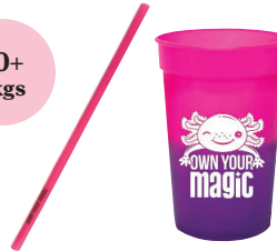
Mood Cup AND Straw