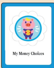
My Money Choices