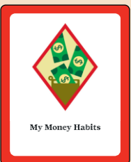
My Money Habits