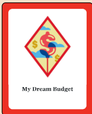
My Dream Budget