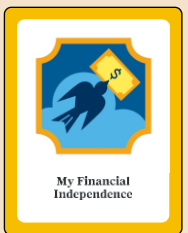
My Financial Independence