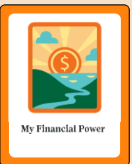
My Financial Power