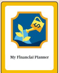
My Financial Planner

* Check with your council for more information on how to earn Financial Literacy badges.