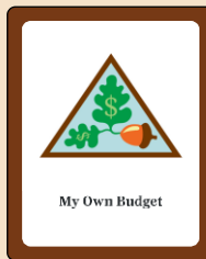
My Own Budget